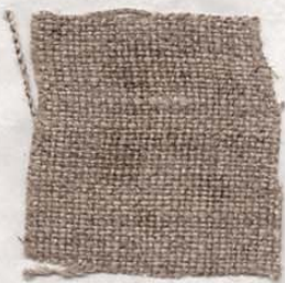
Linen - good for frocks

Coat List: 4 yds dark drab wool 1 yd light drab for facings 25 3/4" buttons, 4 hooks and eyes Pattern: 1750's Coat with Military Variations for the Officer or Enlisted Man by J.P. Ryan, available from many sutlers